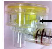
Crooked Mushroom Valve

If it is not properly seated, simply remove the cap on the back of the exhalation housing where the yellow valve is seated by turning it counter-clockwise and lift slightly. DO NOT touch the mushroom valve or you may contaminate the circuit.