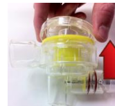
Lift valve housing slightly

Place the cap back on the housing body and twist clockwise until it locks. This will automatically re-seat the valve properly.