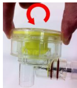
Twist valve cap counterclockwise

If it is not properly seated, simply remove the cap on the back of the exhalation housing where the yellow valve is seated by turning it counter-clockwise and lift slightly. DO NOT touch the mushroom valve or you may contaminate the circuit.