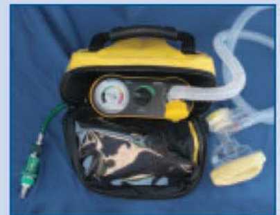
Item # 531501